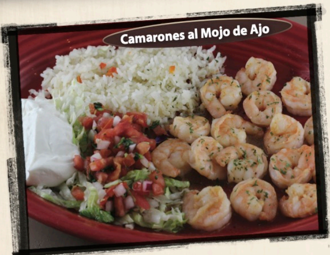
Camarones al Mojo de Ajo