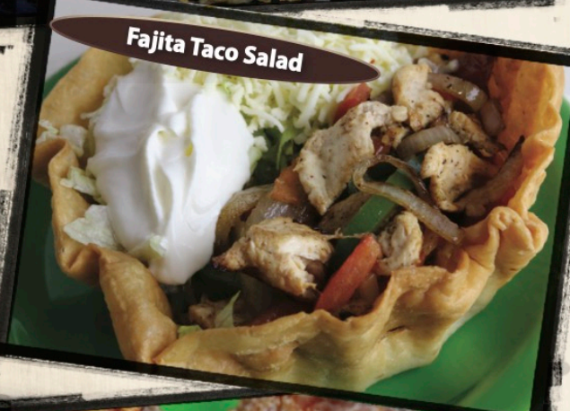
Fajita Taco Salad