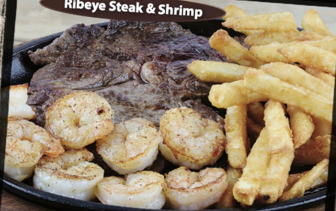
Ribeye Steak & Shrimp