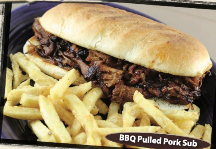
BBQ Pulled Pork Sub

Grilled steak, onions and peppers topped with cheese. Served with French fries. 9.99