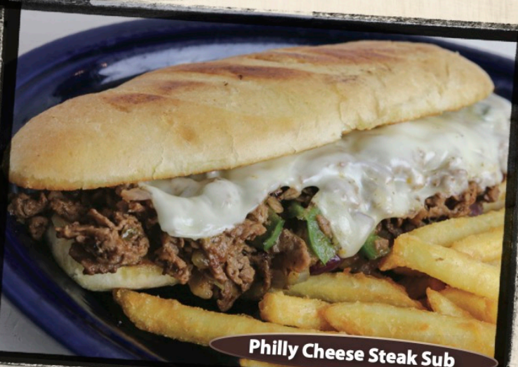
Philly Cheese Steak Sub