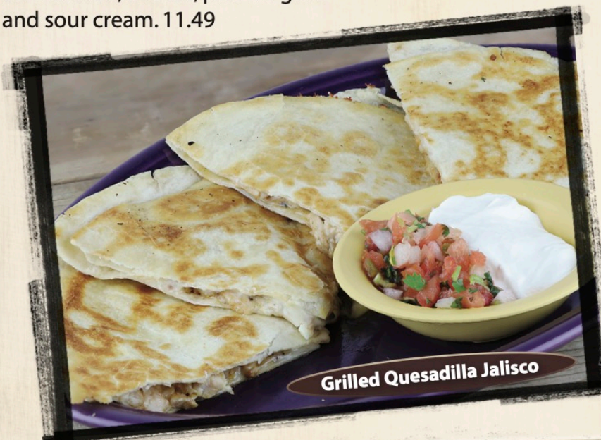
Grilled Quesadilla Jalisco